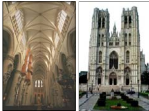
Interior and exterior shots of the Cathedral of St. Michael and St. Gudula, Brussels,

From Saturday evening, June 12 through June 24 I will be away. I have been given the opportunity to travel to Belgium, The Netherlands and Luxembourg. I will stay at a B & B in Brussels, not far from the center of the city and near the Gare du Midi train station. A special Eurail BENELUX pass will allow al-